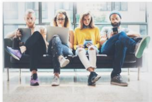
Adult Clients Therapy