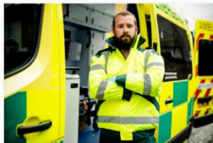
Emergency Responders Therapy