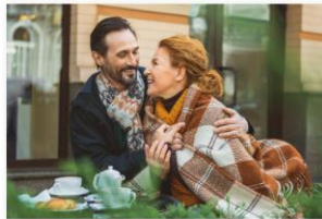
Marriage & Couples Relationship Counseling