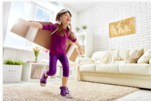
Children & Teens Therapy