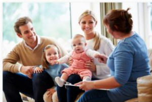
Parents & Co-Parents Therapy and Coaching